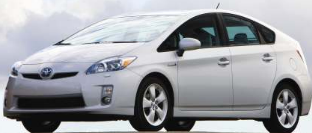
Actual vehicle may differ from picture shown.

Generously donated by Toyota Motor Sales, U.S.A., Inc.